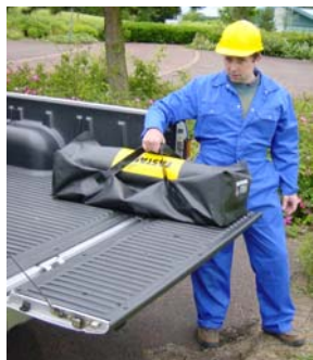
FASTANK-1 Carry Bag